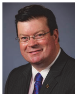
The Hon. Bernie Finn

11 am: The Hon. Bernie Finn, MLC "Marching for the Babies" . Chair: Councillor Rosalie Crestani