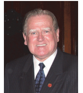
Rev. Fred Nile