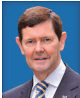
The Hon. Kevin Andrews